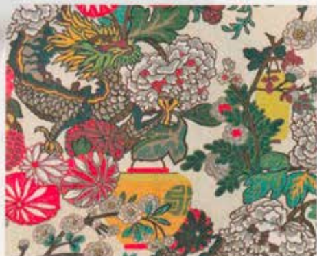
Schumacher's "Chiang Mai Dragon" in Lacquer