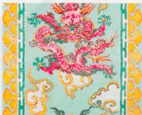
"Enter the Dragons" #2099/02 from No. 9 Thompson (800/262-0336)