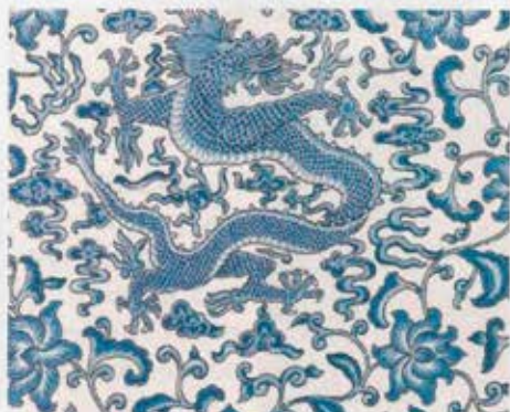
Scalamandré's "Chi'en Dragon" #16428-001 blue on white (800/932-4361)